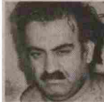
Khalid Shaikh Mohammed

Here are six people — and their suspected roles in the Sept. 11 attacks — who have been considered as potential defendants in a war-crimes trial at Guantánamo Bay, Cuba.