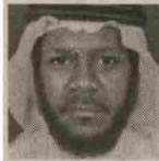
Mustafa Ahmed al-Hawsawi

Paymaster and primary point of contact between Qaeda leadership and the Sept. 11 hijackers.