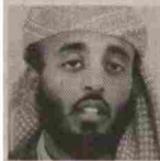
Ramzi bin al-Shibh

The United States educated, senior Qaeda operative who has admitted to being the driving force behind the Sept. 11 attacks.