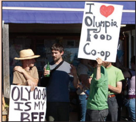
Olympia BDS activists.

CCR and co-counsel won a motion to strike a lawsuit against Board Members of the Olympia Food Co-op after the Board passed a resolution to boycott Israeli products. The court found that the Board members had acted within their duties on an issue of public concern, and that the lawsuit was designed to hamper their free speech rights to engage in a boycott movement of national proportions. The individuals who brought the lawsuit, supported by StandWithUs, were directed to pay attorney fees and penalties for bringing the suit. They have appealed.